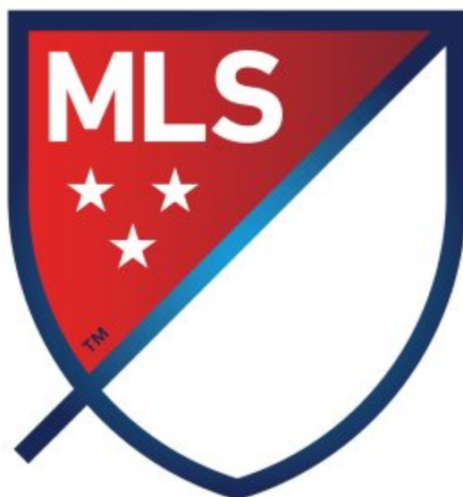
MLS

From my perspective, I like that Javier Tebas challenged the system. He made a statement of intent by questioning the status quo of sports governance in Europe. He didn't win the first round, but it's a long-term play that has gotten a lot of people to pay attention to LaLiga outside of Spain. The strategy is working. On my television (in the USA), I can watch games from all five major European football leagues, as well as Mexico and MLS. This was not the case five years ago.