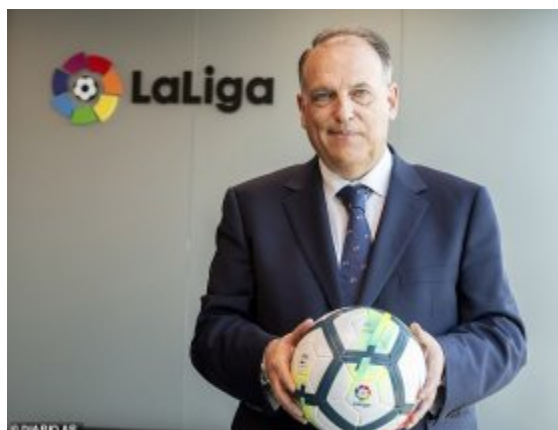
J. Tebas, LaLiga

I very sincerely want to give great credit to Javier Tebas. He's an interesting guy, though I've only met with him a few times. But he's very disruptive and visionary.