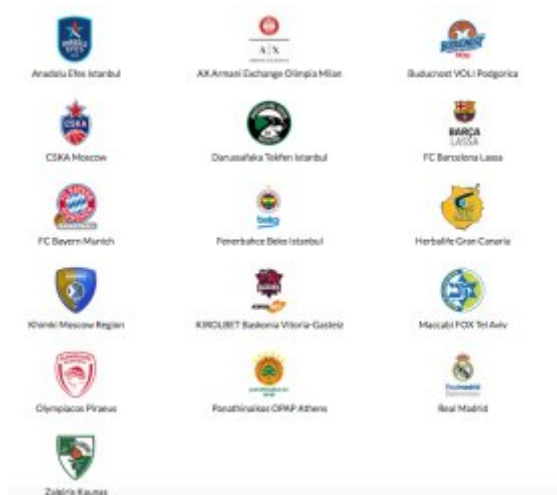
2018-19 Turkish Airlines Euroleague : the 16 teams